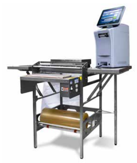
Step-Saver Hand Wrapping Station shown with 840 Manual Label Printer with shelf support leg configuration

The Step-Saver Hand Wrapping Station outfitted with a controller and label printer is the perfect solution for low-volume daily weigh, wrap and label needs. For larger retailers, the Step-Saver is an excellent backup system to handle peak shopping hours.